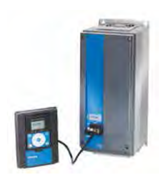
Keypad door mounting kit