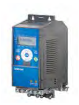
Option board mounting kit